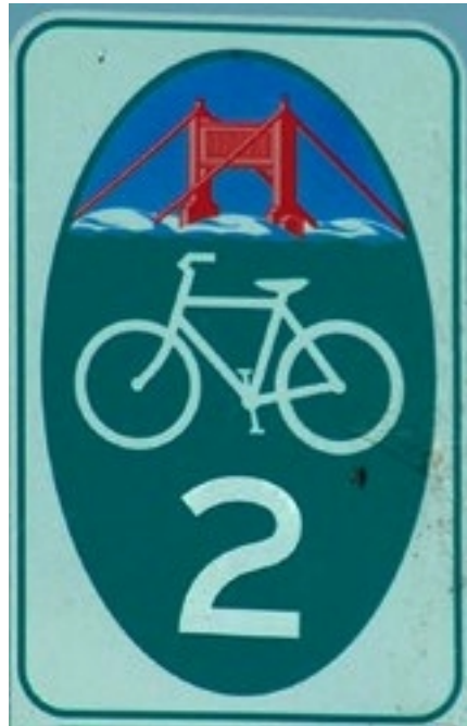
San Francisco, California