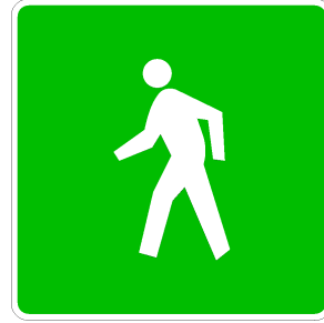
D11-2 450 x 450 mm (18 x 18 in) min. White symbol & border on green background