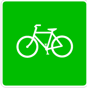
D11-1a 450 x 450 mm (18 x 18 in) min. White symbol & border on green background